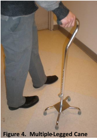
Figure 4. Multiple-Legged Canes

Multiple-legged canes typically have four, though