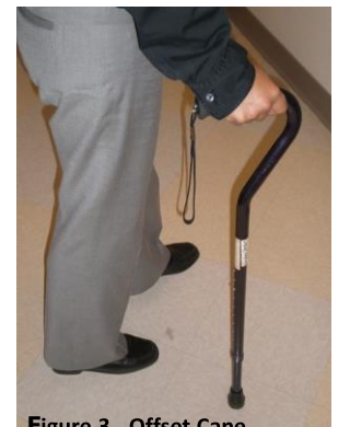
Figure 3 . Offset Cane

Offset canes are often recommended for patients who have arthritis in the hip or knee and occasionally need to decrease the weight borne on a painful lower extremity.