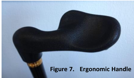
Figure 7. Ergonomic Handle

grips (Figure 6) are less likely to cause this problem. Patients who need wrist support or who have a need to decrease stress on the wrist may benefit