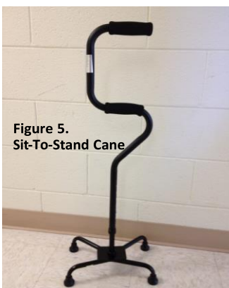
Figure 5. Sit-To-Stand Canes

In addition to weight bearing, another advantage of a quad cane is that it can stand upright by itself when not in use. This frees the patient's hands to do other things until they need to resume walking, and the cane can be retrieved without the need to bend down. In addition, a modification known as a "sit-to-stand cane" combines the stability of a multi-legged base with a bent handle that can be gripped at two levels (Figure 5). This allows the patient to put weight on the cane via the lower part of the handle when rising from a sitting position.