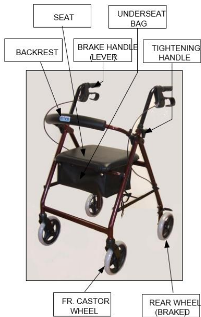
The diagram (left) shows a four wheel rollator